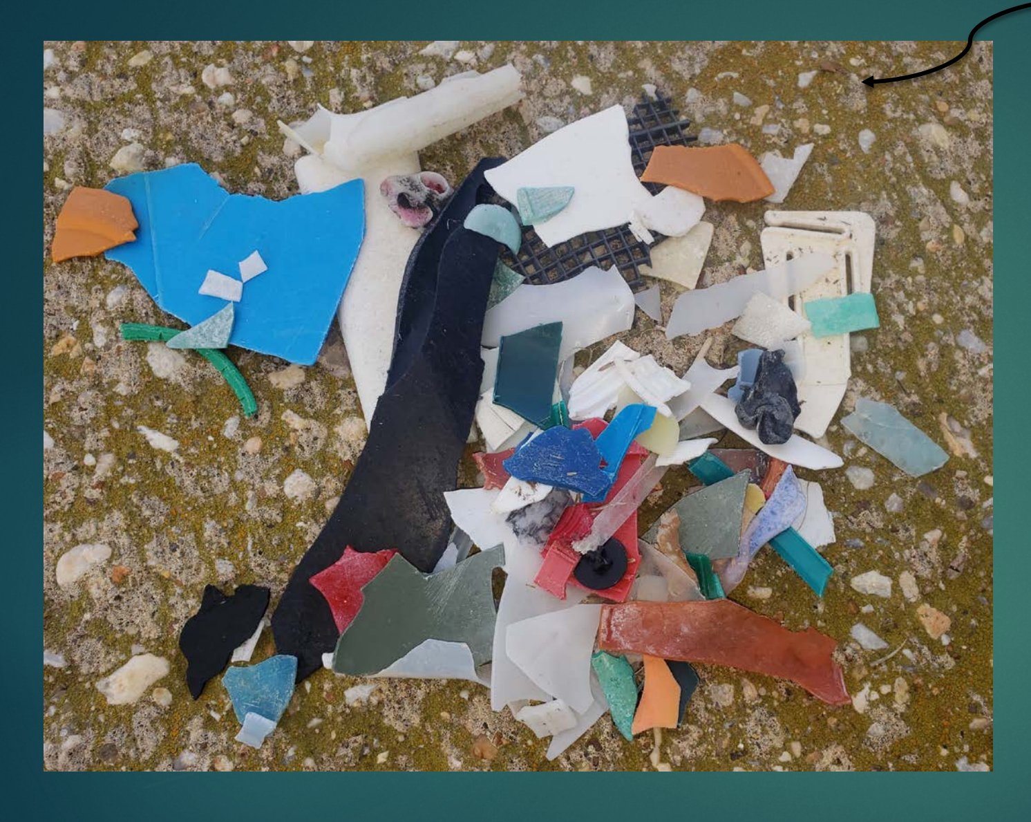
Miscellaneous bits of hard plastic